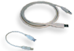
2m and 0.5m USB cables