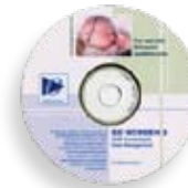
EZ•Screen PC software