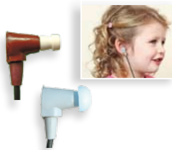
OAE probes 288-I 1 x TE 288-II 1 x DP, 1 x TE

30-38 Beaconsfield Road Hatfield Herts AL10 8BB UK tel 1 800 659 7776 email sales@otodynamics.com www.otodynamics.com/Echoport288-1